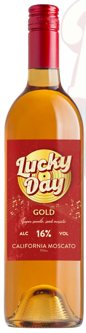
Lucky Day Gold

Lucky Day Moscatos are true California Moscatos, crafted with expertise from real, sun-ripened fruit with rich flavors and natural sweetness. At 16% alcohol, our Moscatos offer wine drinkers a premium choice when selecting a higher-alcohol sweet wine. Lucky Day's portfolio includes Lucky Day Red, a Black Muscat blend with dark fruit flavors, and Lucky Day Gold, made from Orange Muscat grapes with zesty citrus notes and touches of stone fruit. Serve chilled while vibing to your favorite beats.