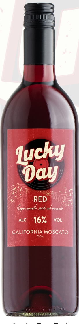
Lucky Day Red